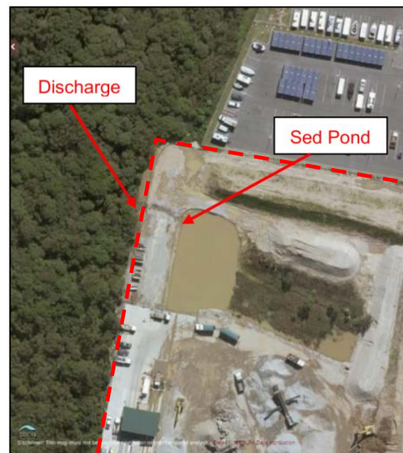
Figure 2: Monitoring locations

Images sourced from Metro Maps Photomaps, dated 17 December 2019