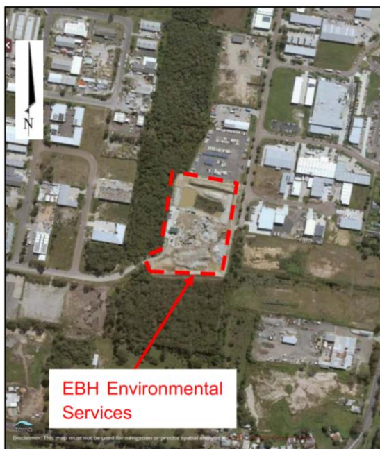
Figure 1: Site Locality

Images sourced from Metro Maps Photomaps, dated 17 December 2019