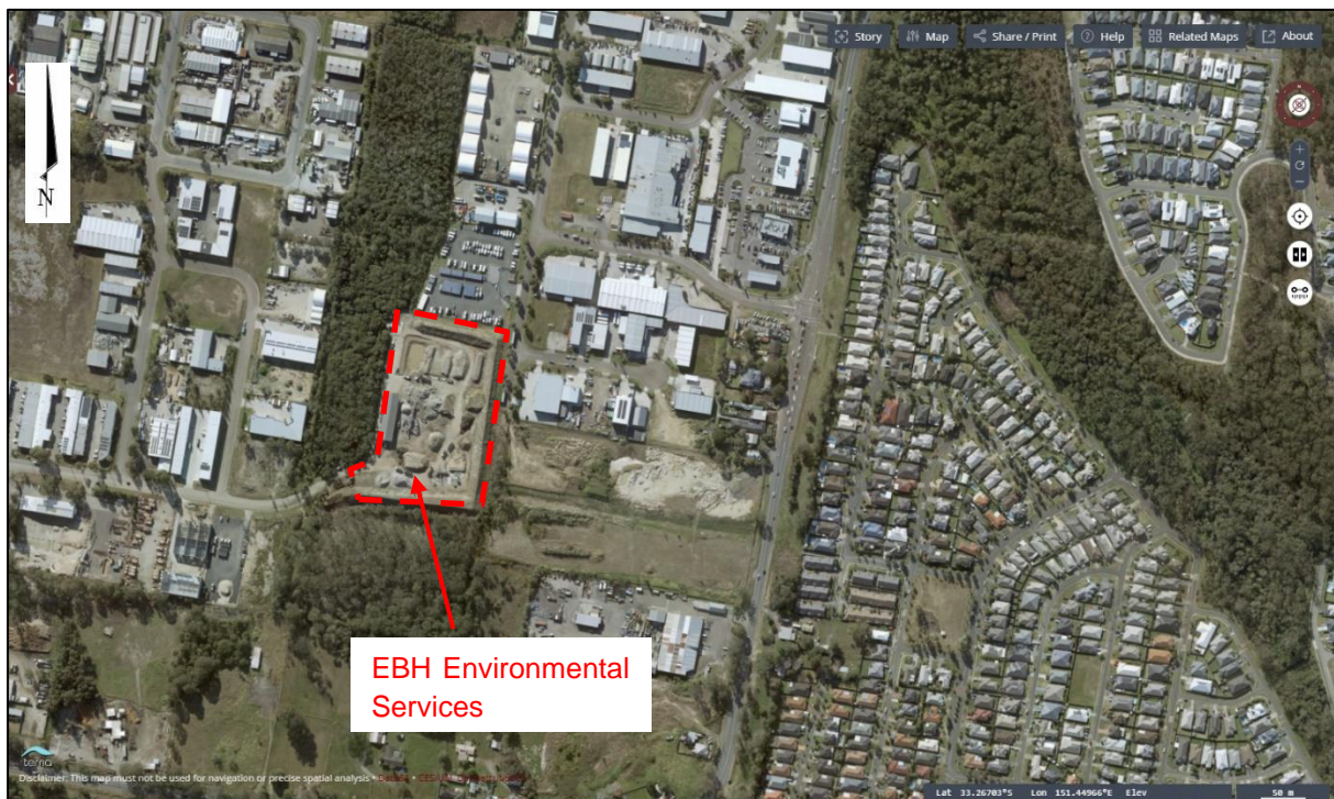
Figure 1 – Site Locality (sourced from Metro Maps Photomaps, dated 25 June 2022)

EBH Environmental Services (EBH) facility is located at 60 Donaldson Street, Wyong (refer Figure 1).